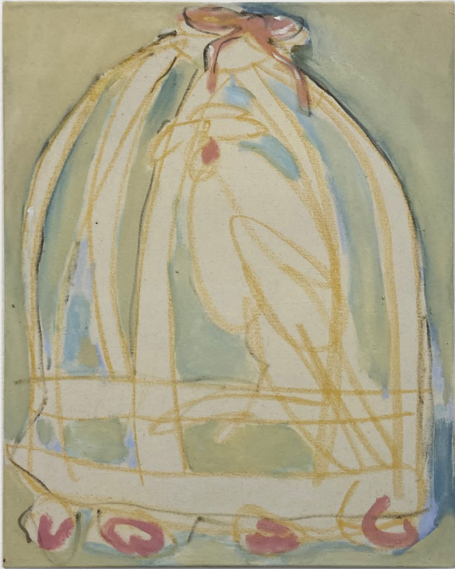
Loris 2023, oil on canvas, 40x30 cm