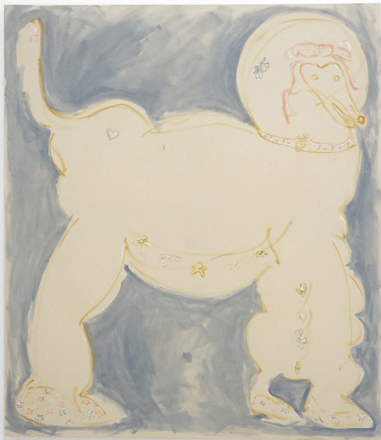
Amedea 2023, oil on canvas, 150x140cm