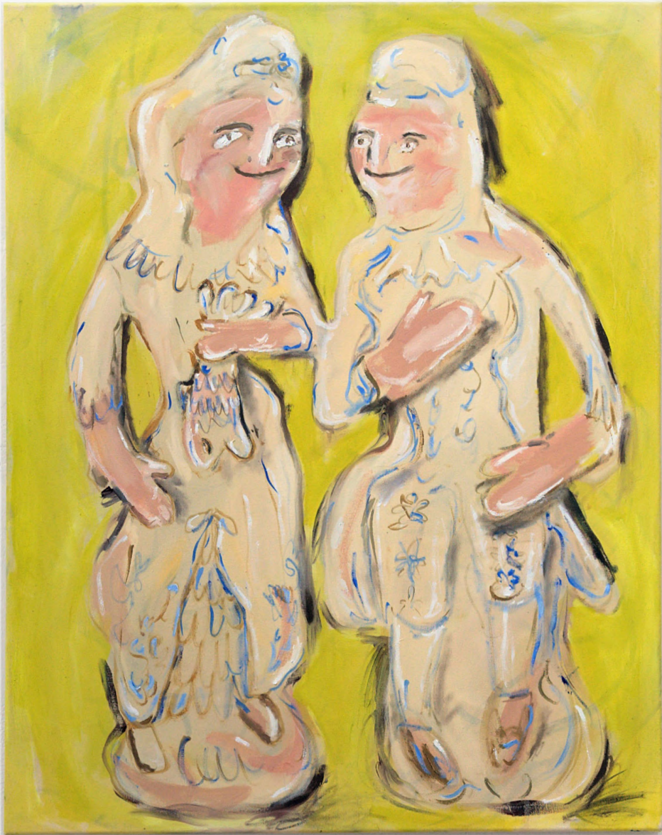
Fishing at Breakfast 2023, oil on canvas, 95x75 cm