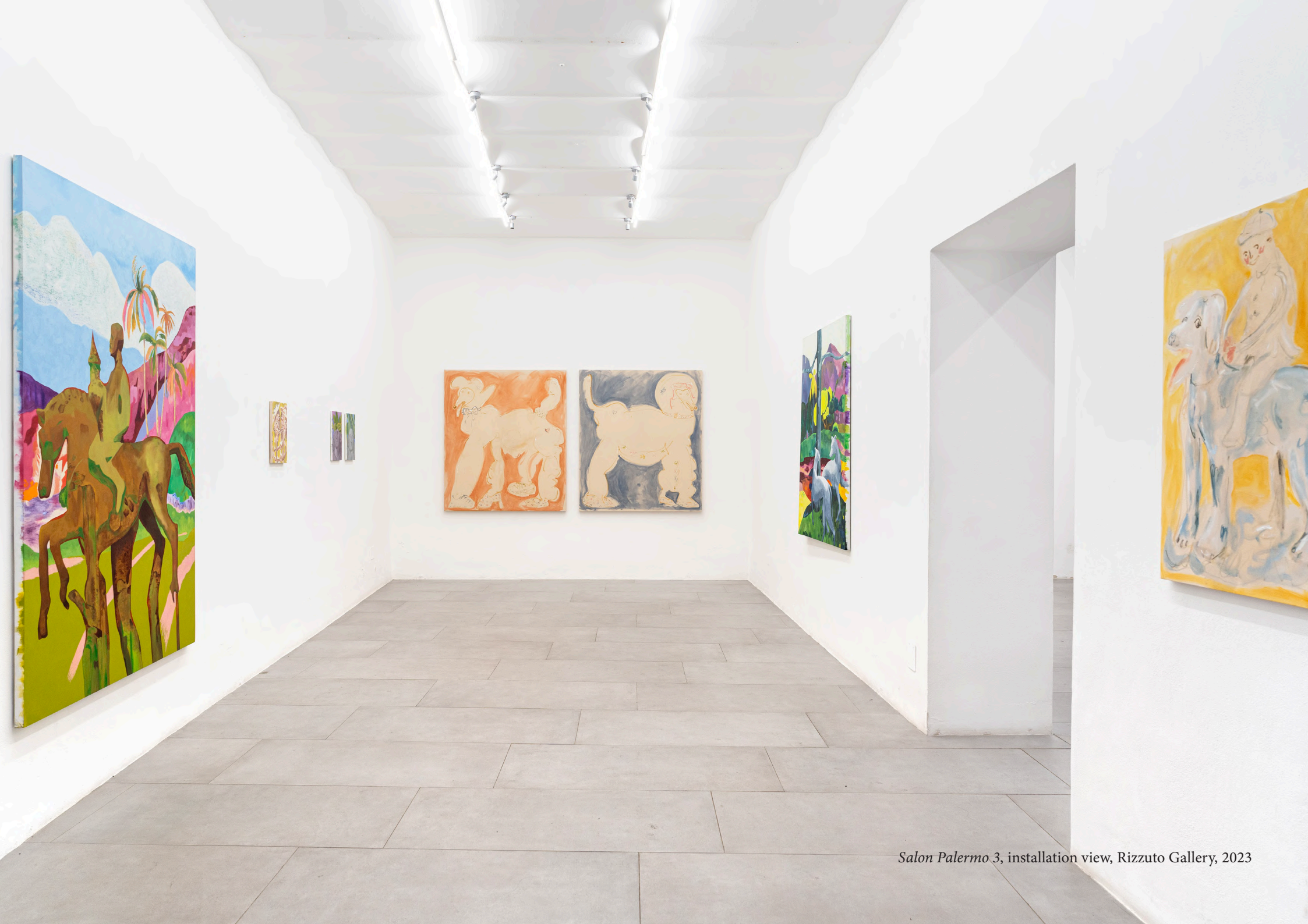
Salon Palermo 3, installation view, Rizzuto Gallery, 2023