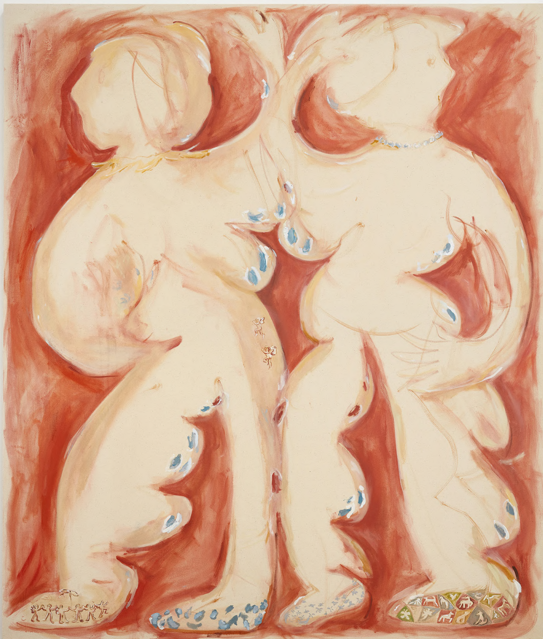
At the Angels' Party 2024, oil on canvas, 200x170cm