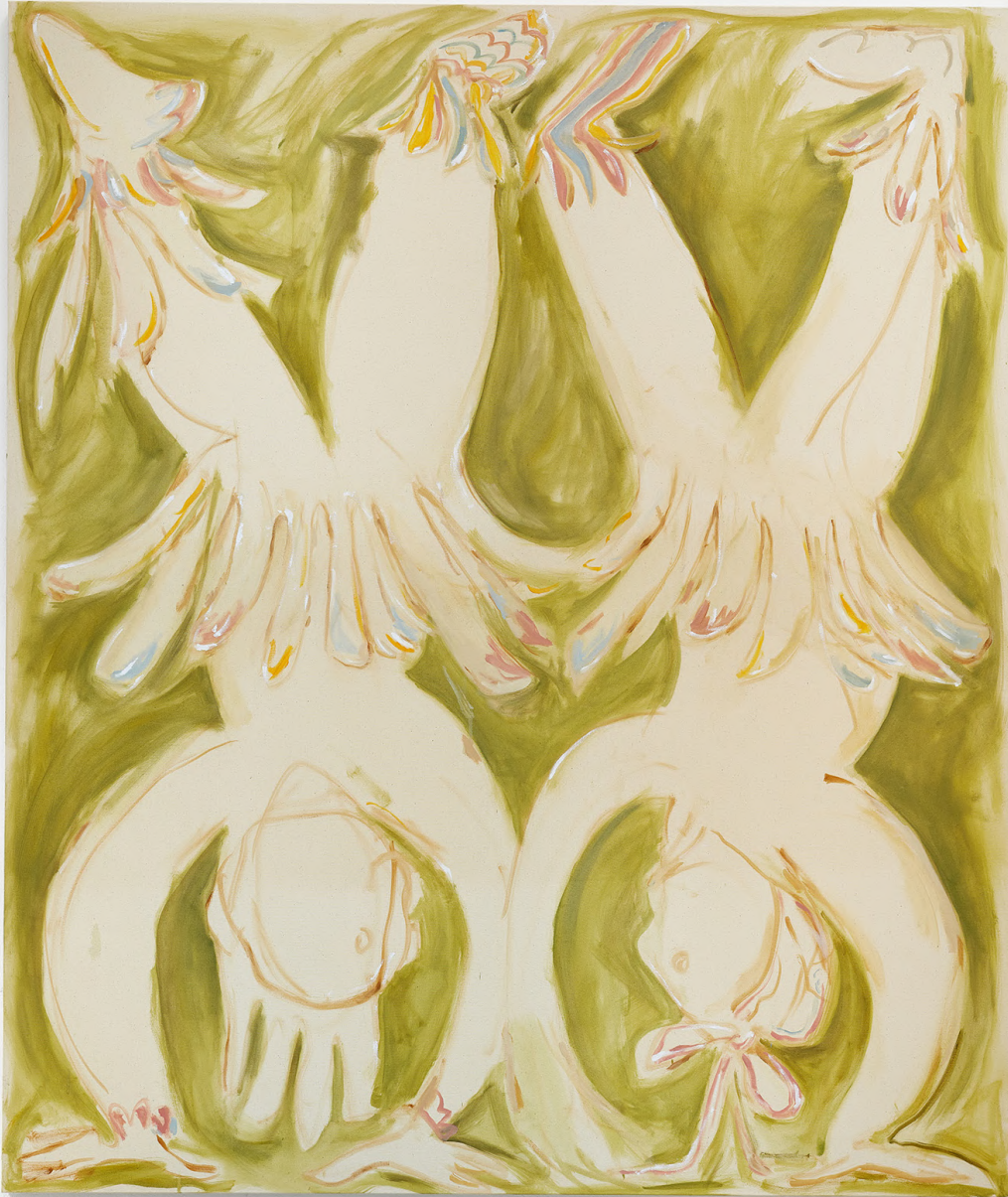
Today in Balance 2024, oil on canvas, 200x170cm