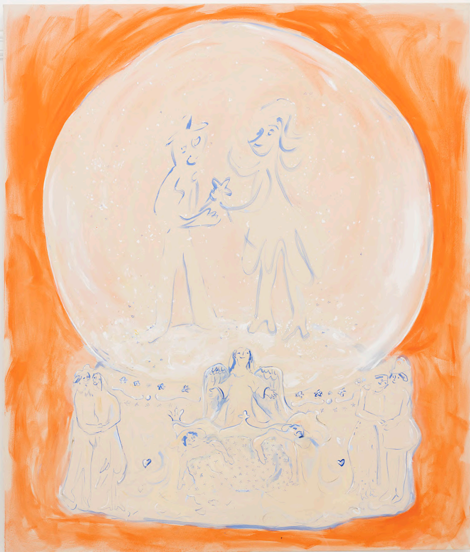
Forever Safe, the secret to Their Deeds 2023, oil on canvas, 200x170 cm