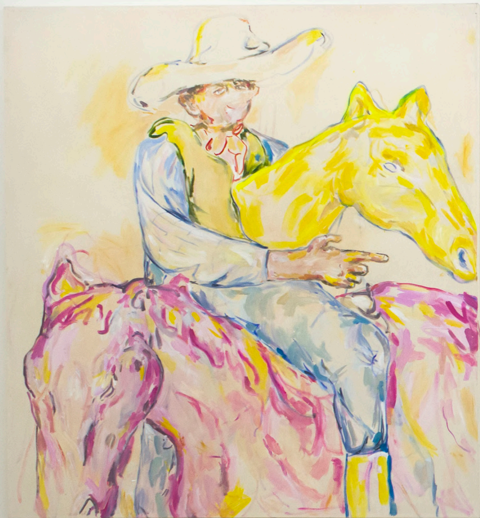
Townboy 2022, oil on canvas, 200x184 cm