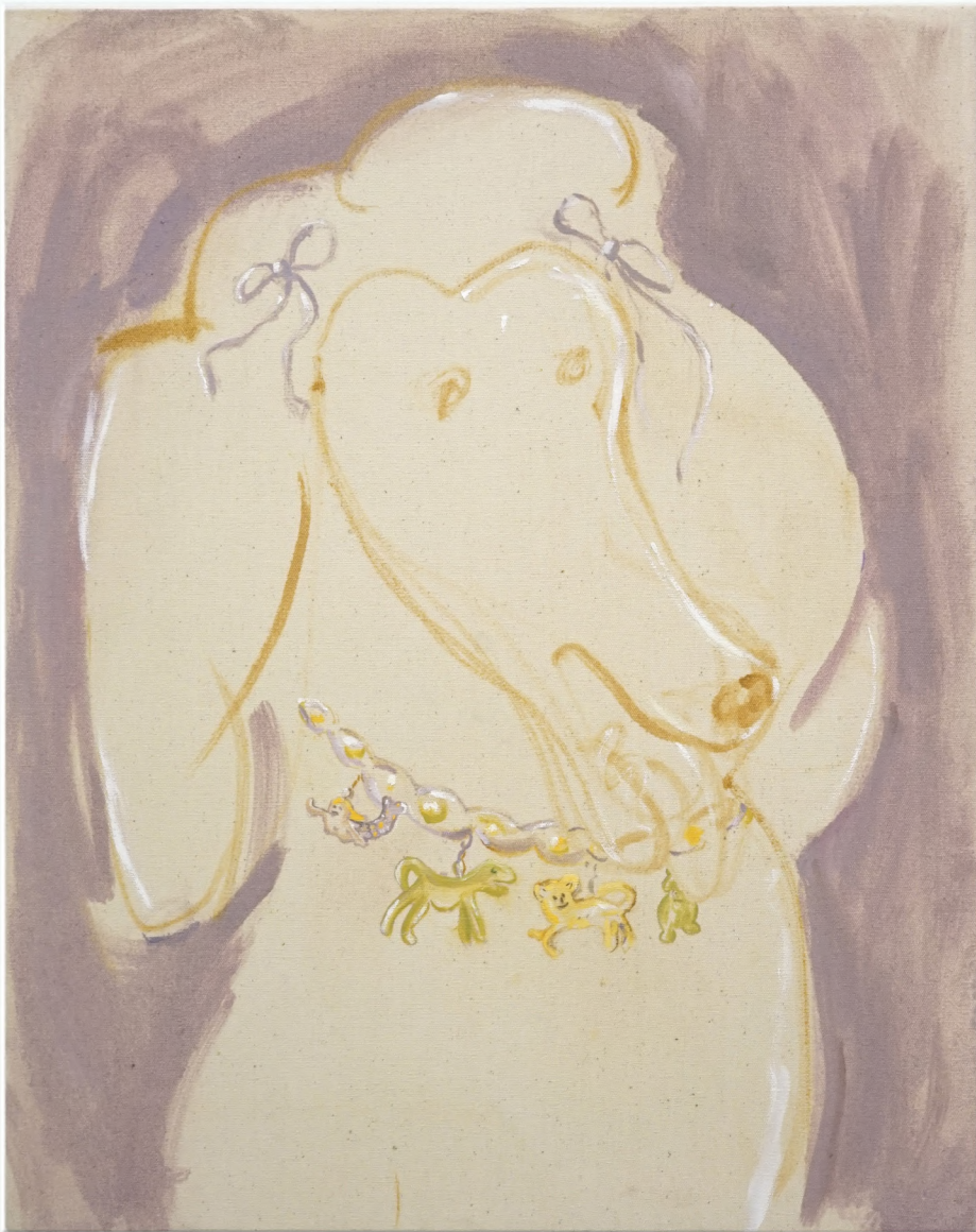
Carla 2023, oil on canvas, 40x30 cm