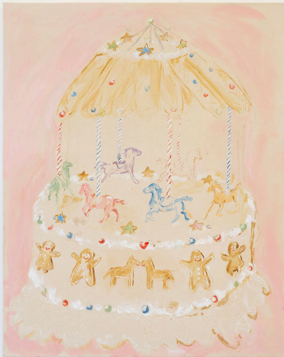
Cake Ride 2023, oil on canvas, 95x75 cm