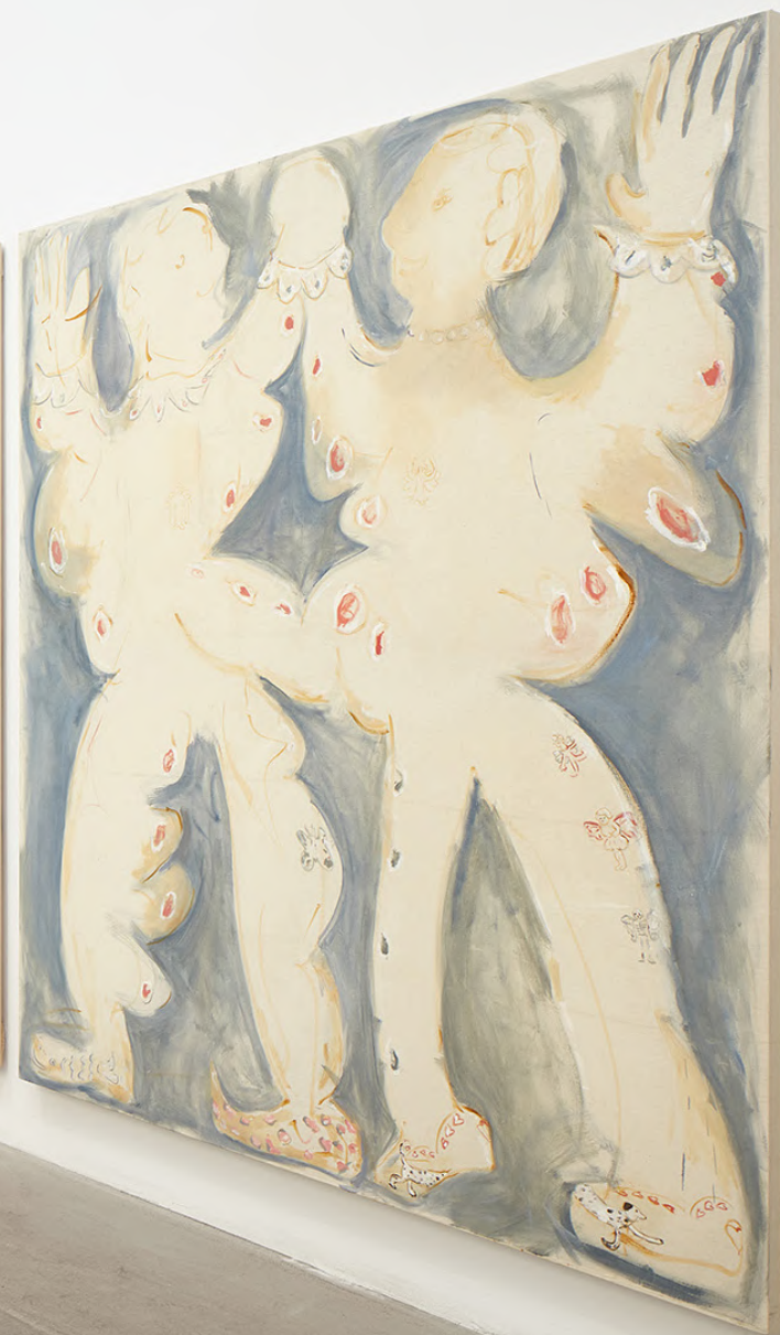
Mock Yourself , installation view, Nevven Gallery, Bologna, 2024