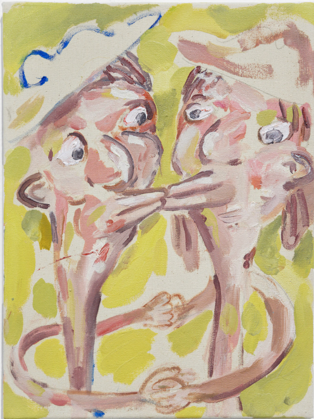
Come mi ami tu 2022, oil on canvas, 30x40 cm