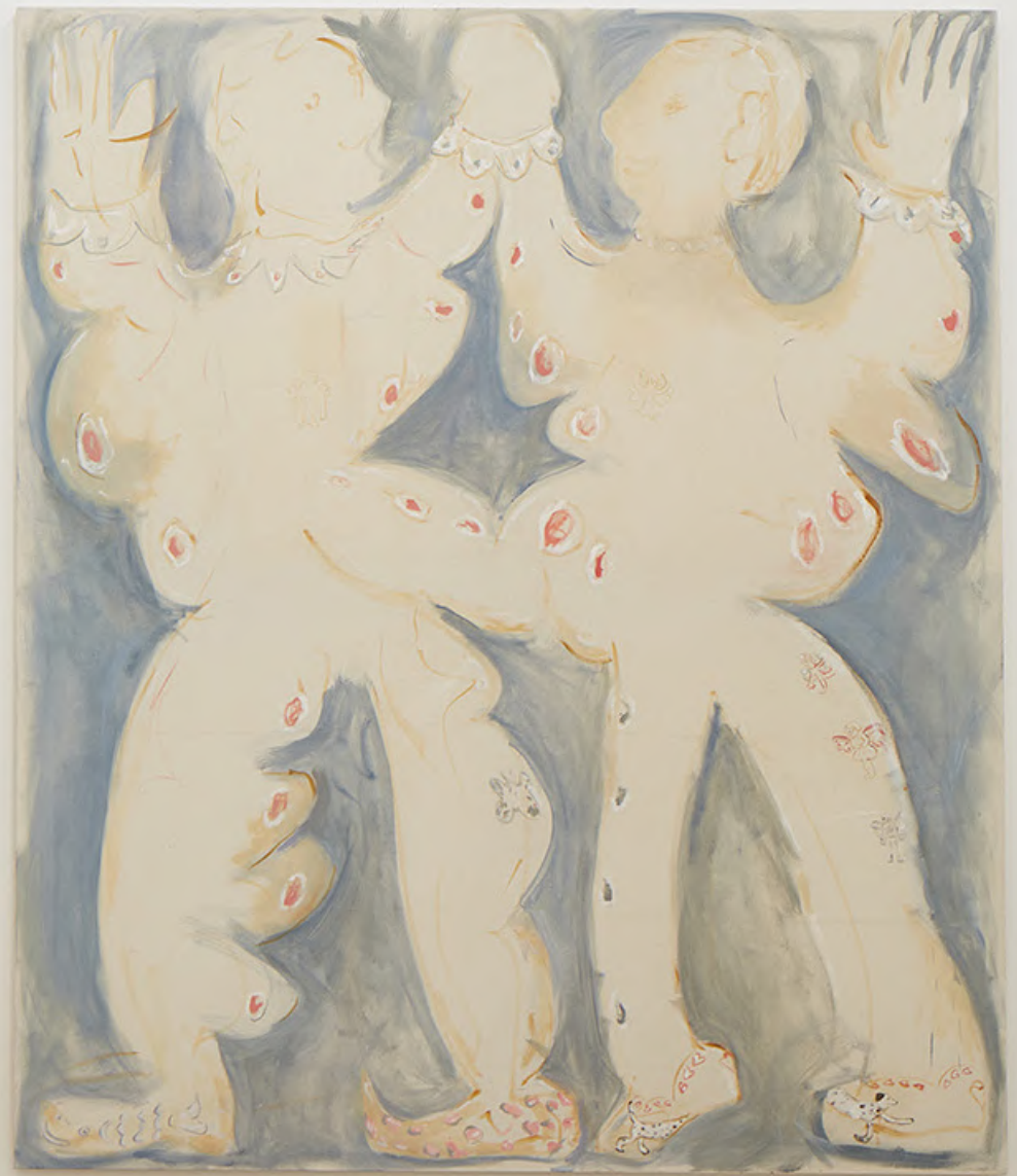
Mock Yourself , installation view, Nevven Gallery, Bologna, 2024