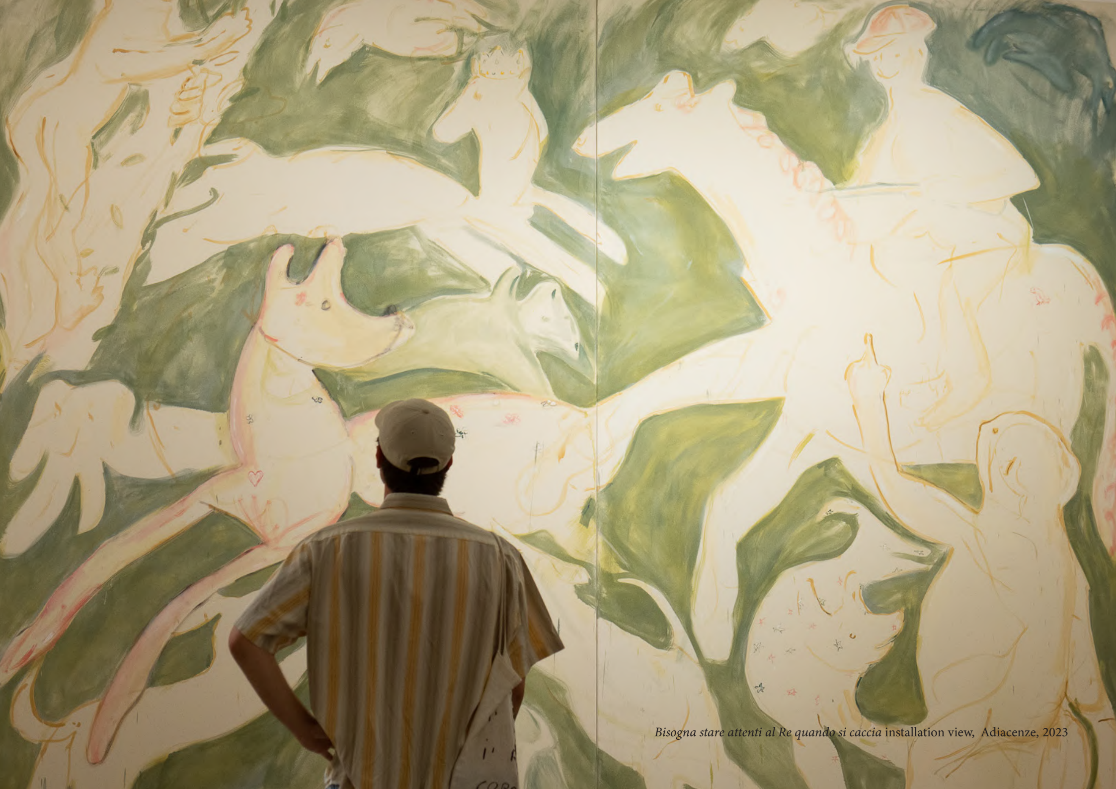
Bisogna stare attenti al Re quando si caccia installation view, Adiaccenze, 2023