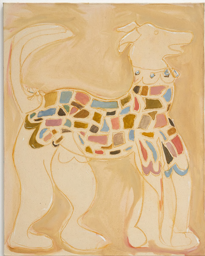
Il Principe dei Sogni 2023, oil on canvas, 95x75cm