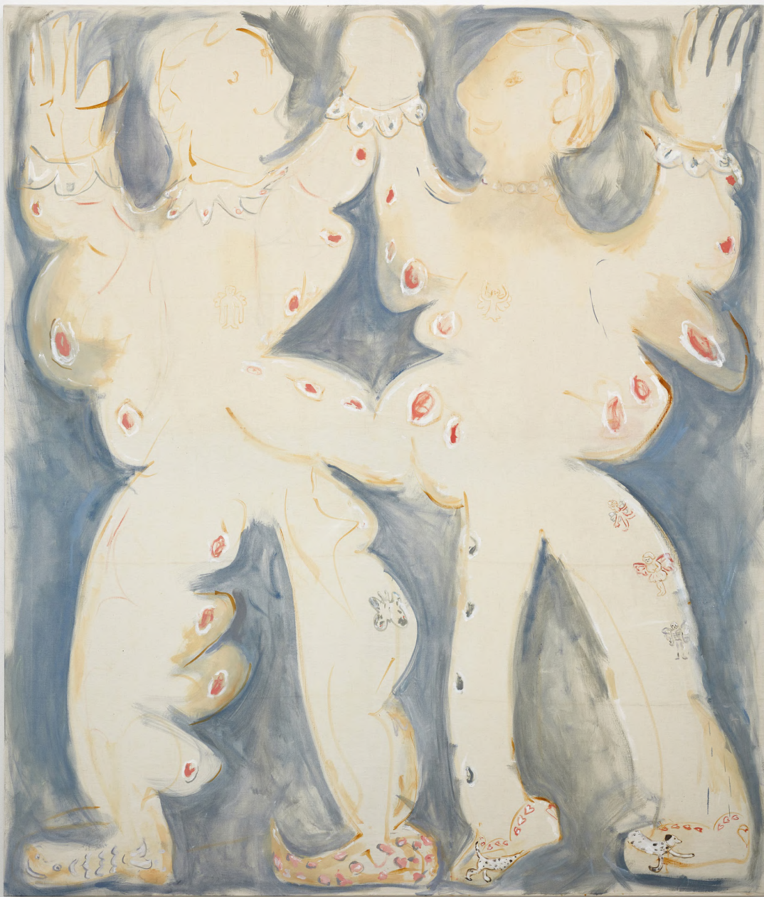
Mock Moth 2023, oil on canvas, 200x170cm