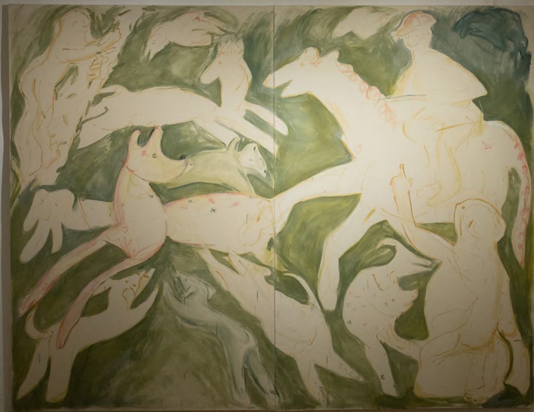
Bisogna stare attenti al Re quando si caccia 2023, oil on canvas, 400x300cm