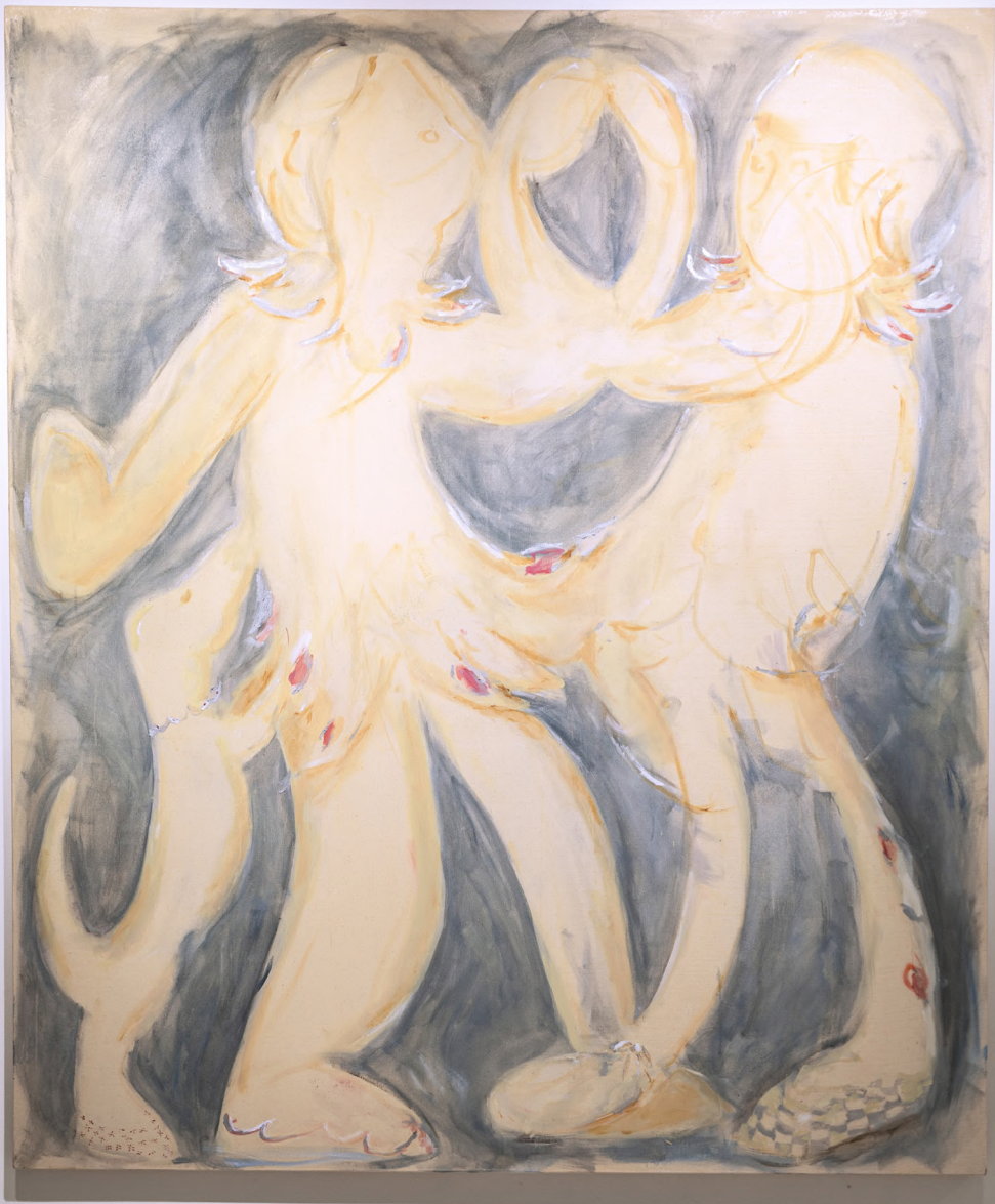
Niente di pericoloso, Niente di speciale 2024, oil on canvas, 200x170 cm