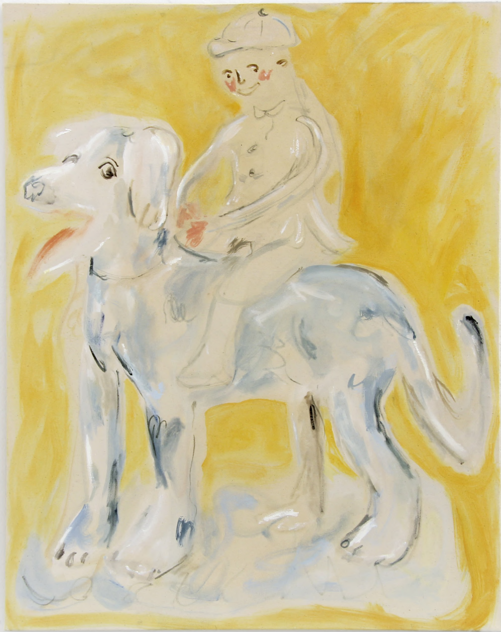
Napoleone, bastava avere un cane 2023, oil on canvas, 95x75cm