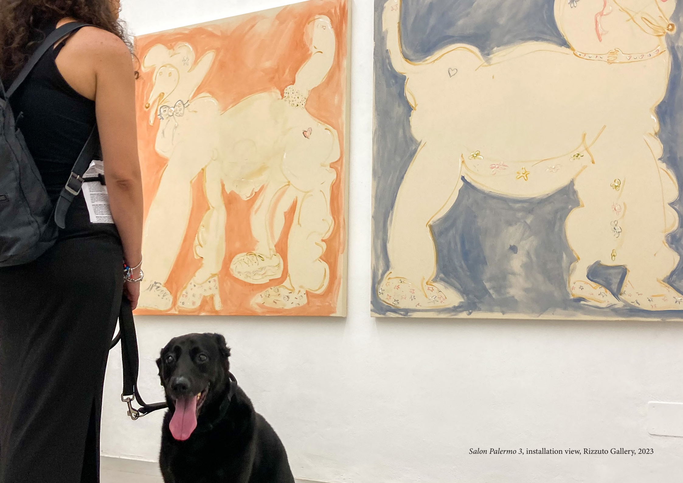
Salon Palermo 3 , installation view, Rizzuto Gallery, 2023