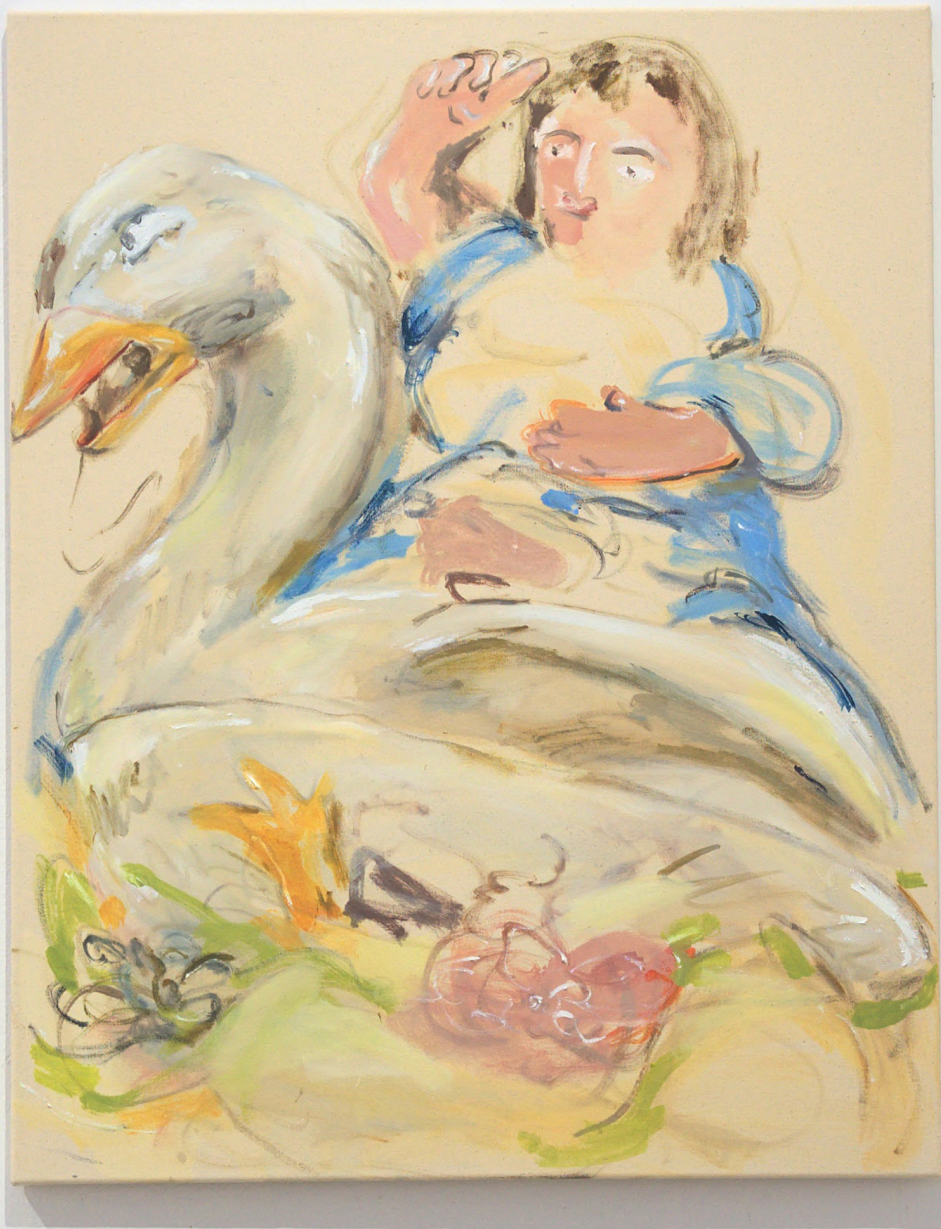
Quando abbiamo deciso di comprare tutte le guerre 2023, oil on canvas, 95x75 cm