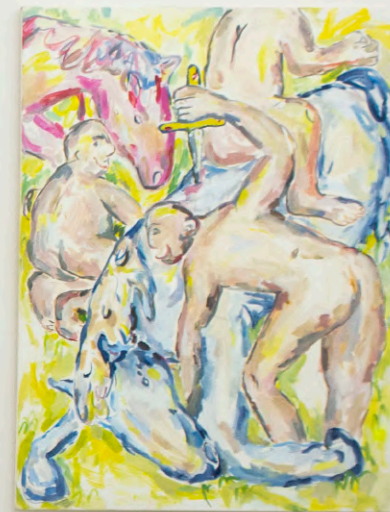
Progetto scorsoio installation view, LABS Gallery, Bologna, 2022