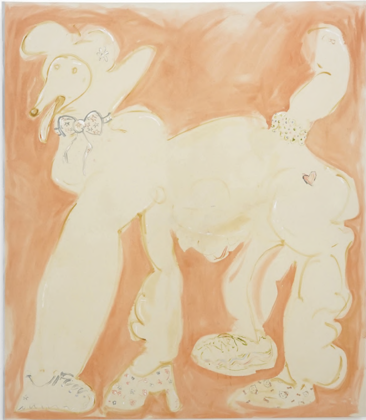
Osvaldo 2023, oil on canvas, 150x140cm