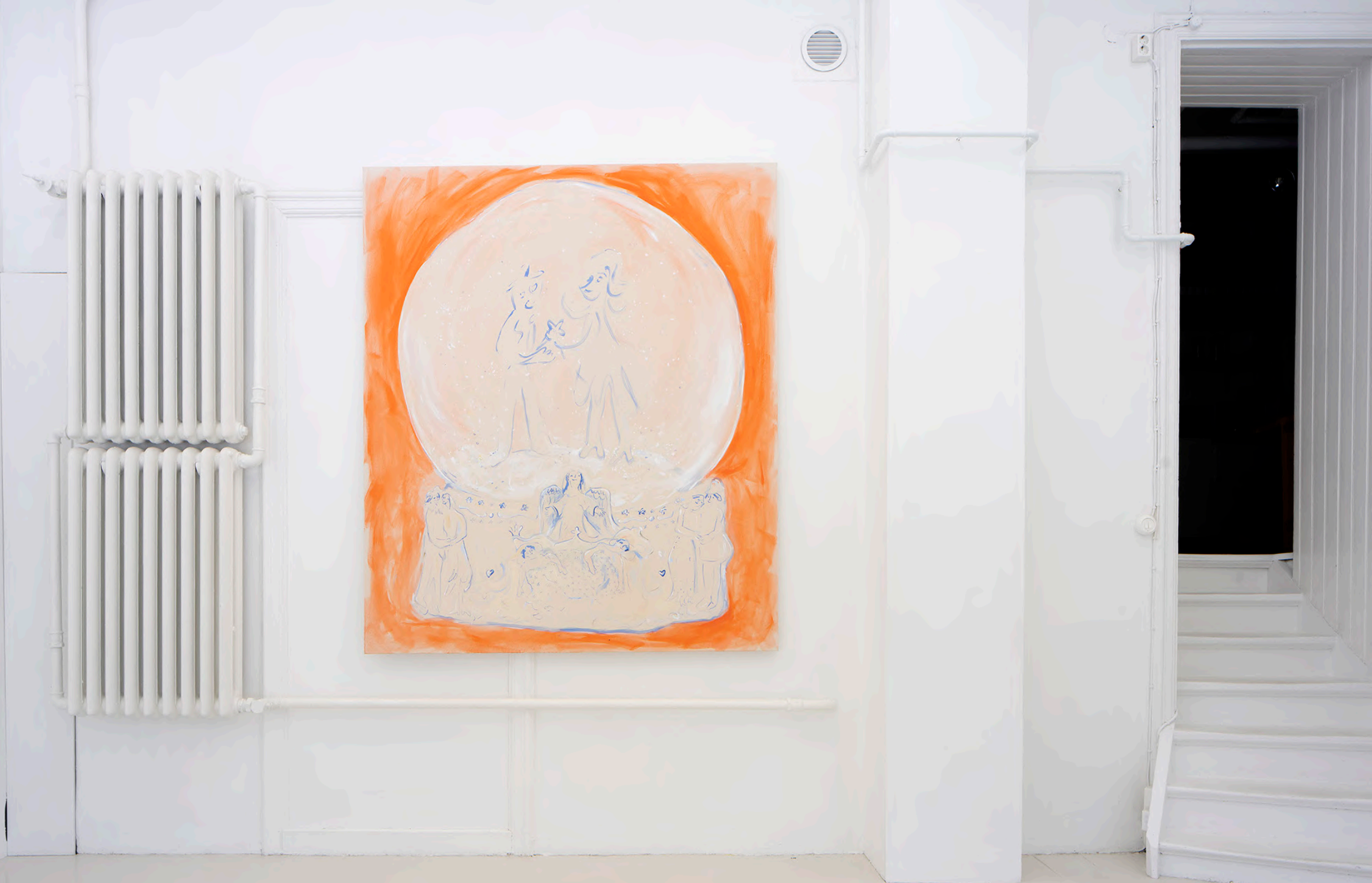
All dreams, all stone installation view, Nevven Gallery, Göteborg, 2023