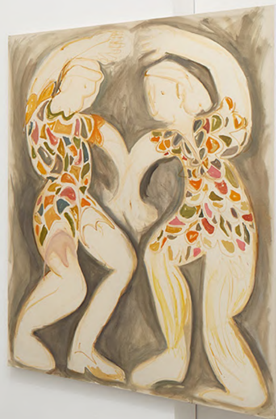
Mock Yourself , installation view, Nevven Gallery, Bologna, 2024