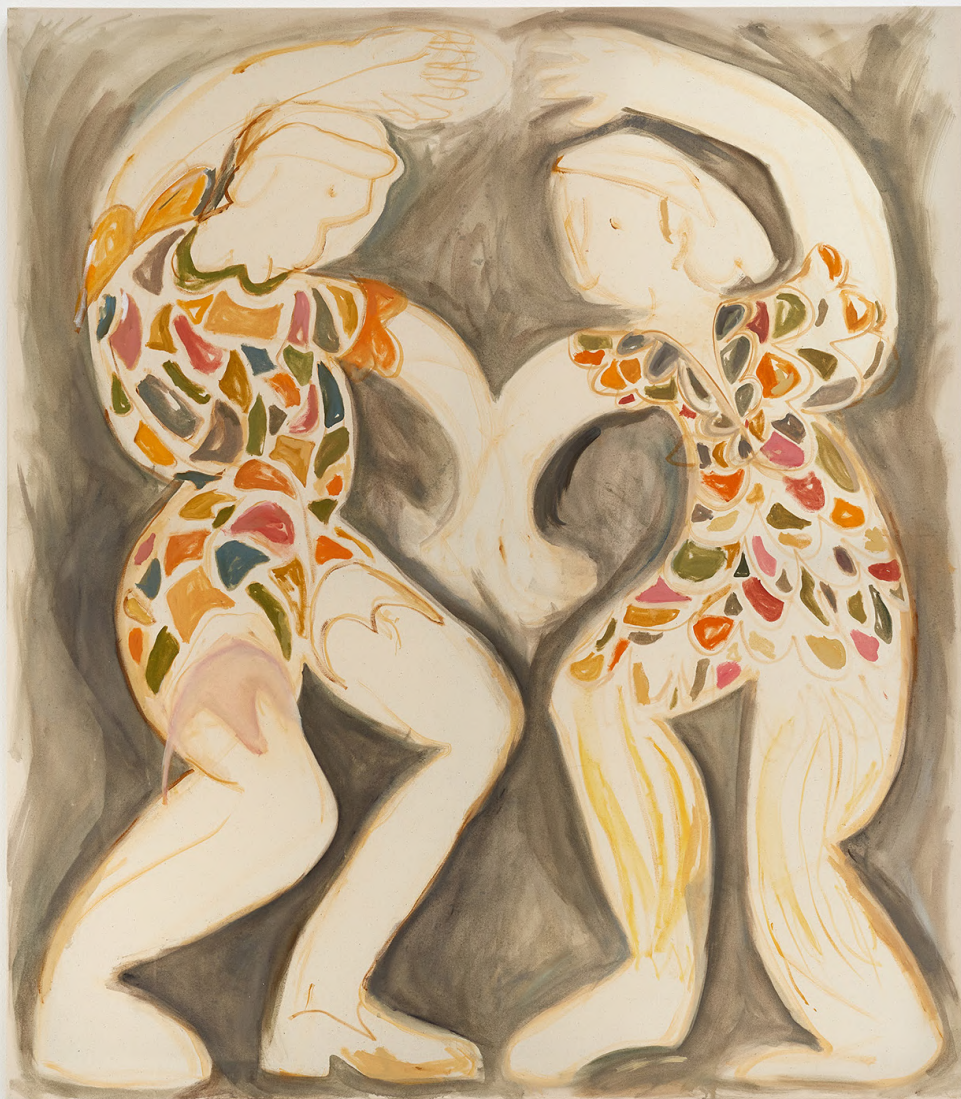
Fear of Being Discovered 2024, oil on canvas, 160x140cm