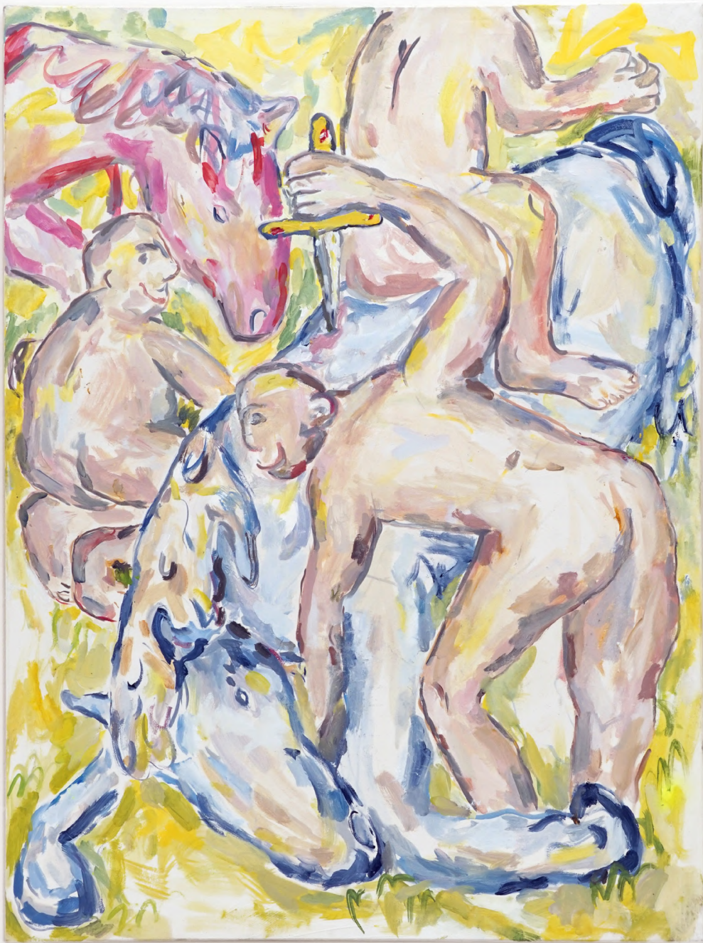
In quel giorno, Pugnale, avvertì la libertà 2022, oil on canvas, 120x100 cm